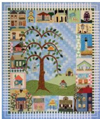
2012 Raffle Quilt

Come to The Official Chicken Cook-off for the State of Georgia in Gainesville, on the shores of Lake Lanier.