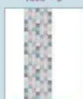
Patchwork the Scraps