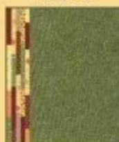
Strip Up the Scraps