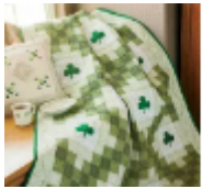
Shamrock Chain: Strip Pieced Irish Chain Throw Quilt Pattern quiltingdaily.com